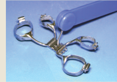
Your orthodontist will explain how to activate your child's appliance

Age alone is not the best predictor when a palatal expansion appliance should be used. Ideally a patient should still be growing. An orthodontist can estimate skeletal maturation and determine whether a patient is still growing by analyzing the growth plates on a hand-wrist x-ray. Patients who have completed growth may require surgically-assisted rapid palatal expansion.