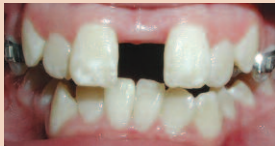
Front view, expansion complete