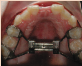
Four weeks later, expansion complete