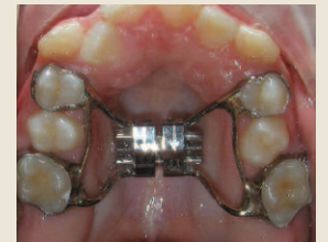
Examples of bonded and banded fixed expansion appliances