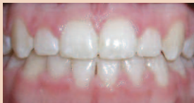
Braces close the spacing and align the bite creating a healthy, beautiful smile

Palatal expansion is a combination of tooth movement and jaw expansion. It works by widening the two halves of the upper jaw, called the palate. The two halves are joined together by a 'suture' in the middle of the roof of the mouth. The orthodontist custom makes an expander for each patient. An expander can be fixed or removable. The expander is attached to the upper back teeth and eases the suture apart, which makes the upper jaw wider. As the jaw expands, new bone fills in between the two halves of the palate. This process is called distraction osteogenesis. Expansion can take a few weeks to a few months, depending on the amount of expansion required for an individual patient.